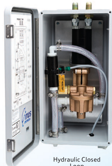
Hydraulic Closed Loop