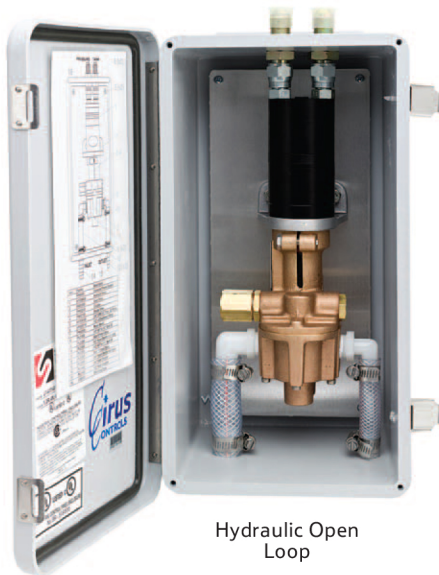
Hydraulic Open Loop